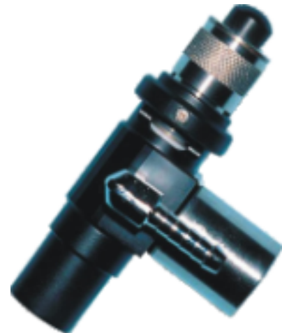
Part No: IRW02