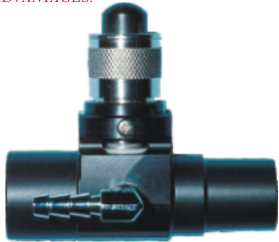
Part No: IRW01