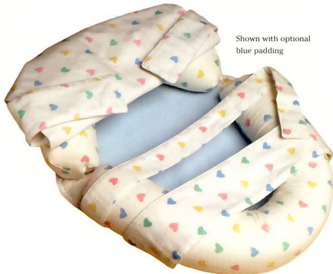
Shown with optional blue padding